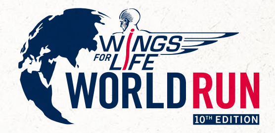
INTERNATIONAL SPORTS DIRECTORS WINGS FOR LIFE WORLD RUN